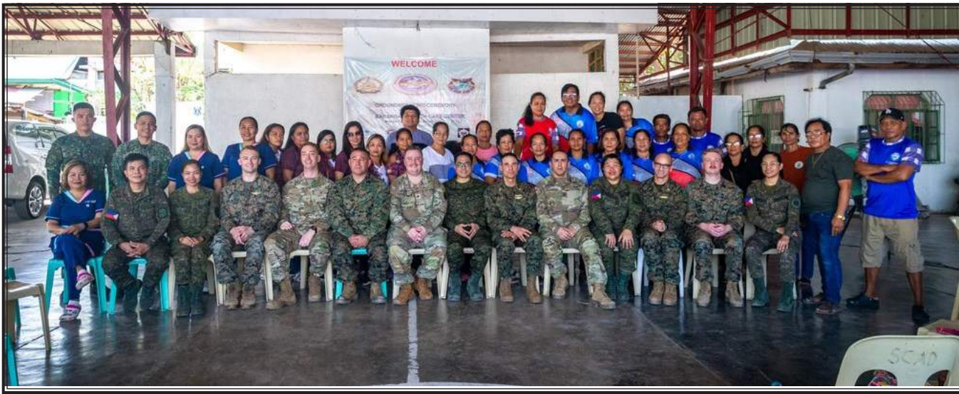
Philippine and U.S. service members with the Combined Joint Civil-Military Operations Task Force pose for a photograph with local healthcare workers and Ilocos Norte residents after a community health engagement held before Exercise Balikatan 24 at Davila Elementary School in Pasuquin, Ilocos Norte, Philippines, April 21, 2024. The Philippine and U.S. service members trained Ilocos Norte healthcare workers and residents on basic lifesaving skills such as cardiopulmonary resuscitation and tactical combat casualty care, increasing emergency care access and awareness. BK 24 is an annual exercise between the Armed Forces of the Philippines and the U.S. military designed to strengthen bilateral interoperability, capabilities, trust, and cooperation built over decades of shared experiences.