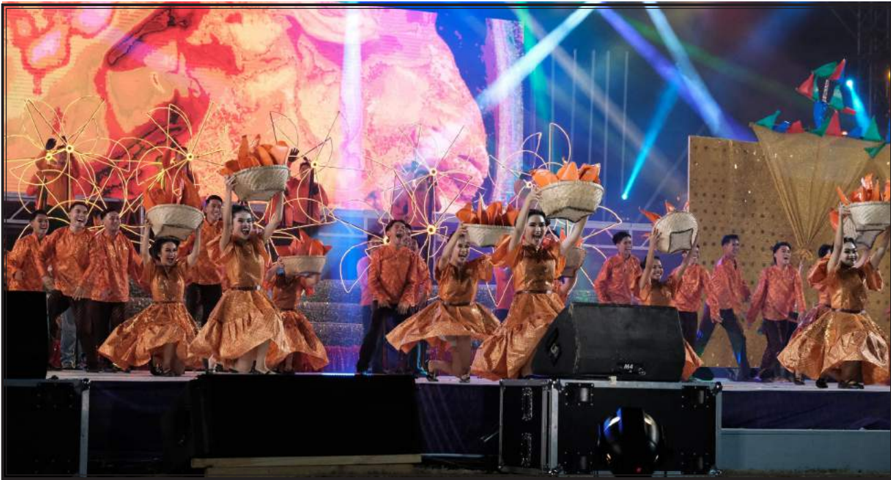
← Photo shows the Batac City Empanada performers during the Tan-ok competition on February 16, 2024. The Empanada Fest emerged as overall champion.

Vol. 18 No. 38 Laoag City, Ilocos Norte, Philippines February 12-18, 2024 P 25.00