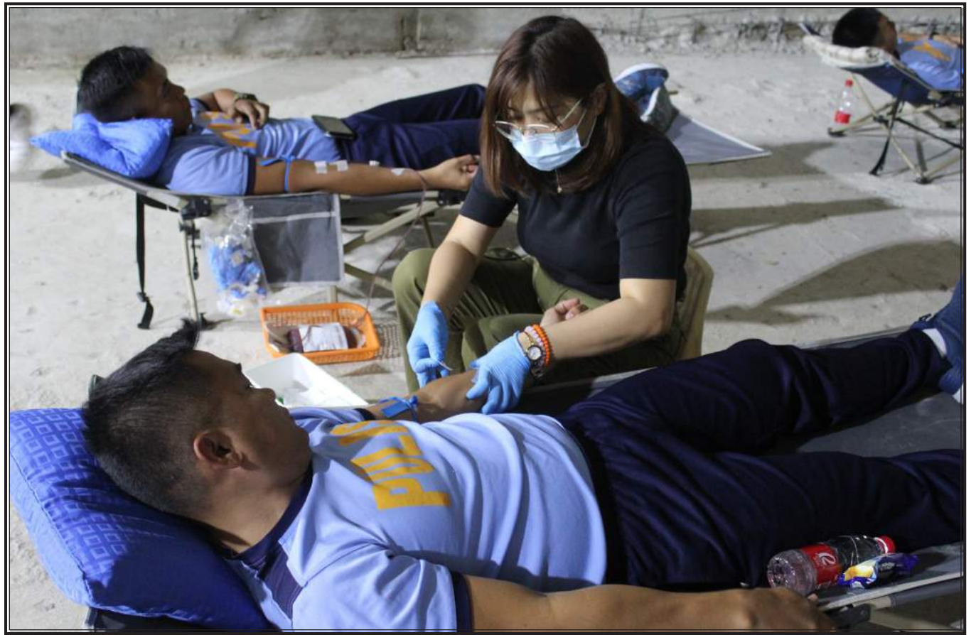
The Ilocos Norte Police Provincial Office in partnership with Robinsons Ilocos and Mariano Marcos Memorial Hospital and Medical Center-National Voluntary Blood Services Program facilitated the 1st Quarter INPPO Dugong Bayani Blood-letting Activity held at Robinsons Ilocos, San Nicolas, Ilocos Norte on January 17, 2024. A total of 34,450 cc of blood donation were extracted from 79 volunteers composed of PNP personnel, KKDAT and Force Multipliers.