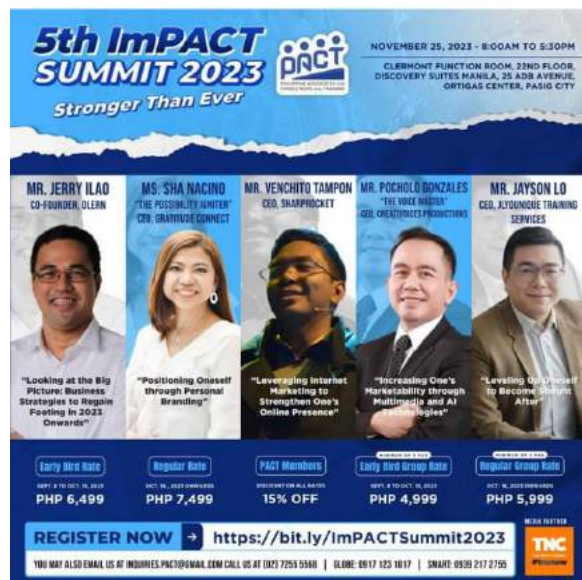
The official event poster of 5TH ImPACT Summit 2023, which will be held on November 25, 2023 at Discovery Suites in Ortigas Center, Pasig City, Metro Manila. The poster is courtesy of Philippine Advocates for Consultants and Trainers, Inc. (PACT).