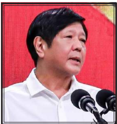
Pres. Marcos Jr.

President Ferdinand R. Marcos Jr. urged the Taclobanons on Wednesday not to forget the victims of super typhoon Yolanda, especially those who have lost their lives and those who were not accounted for.