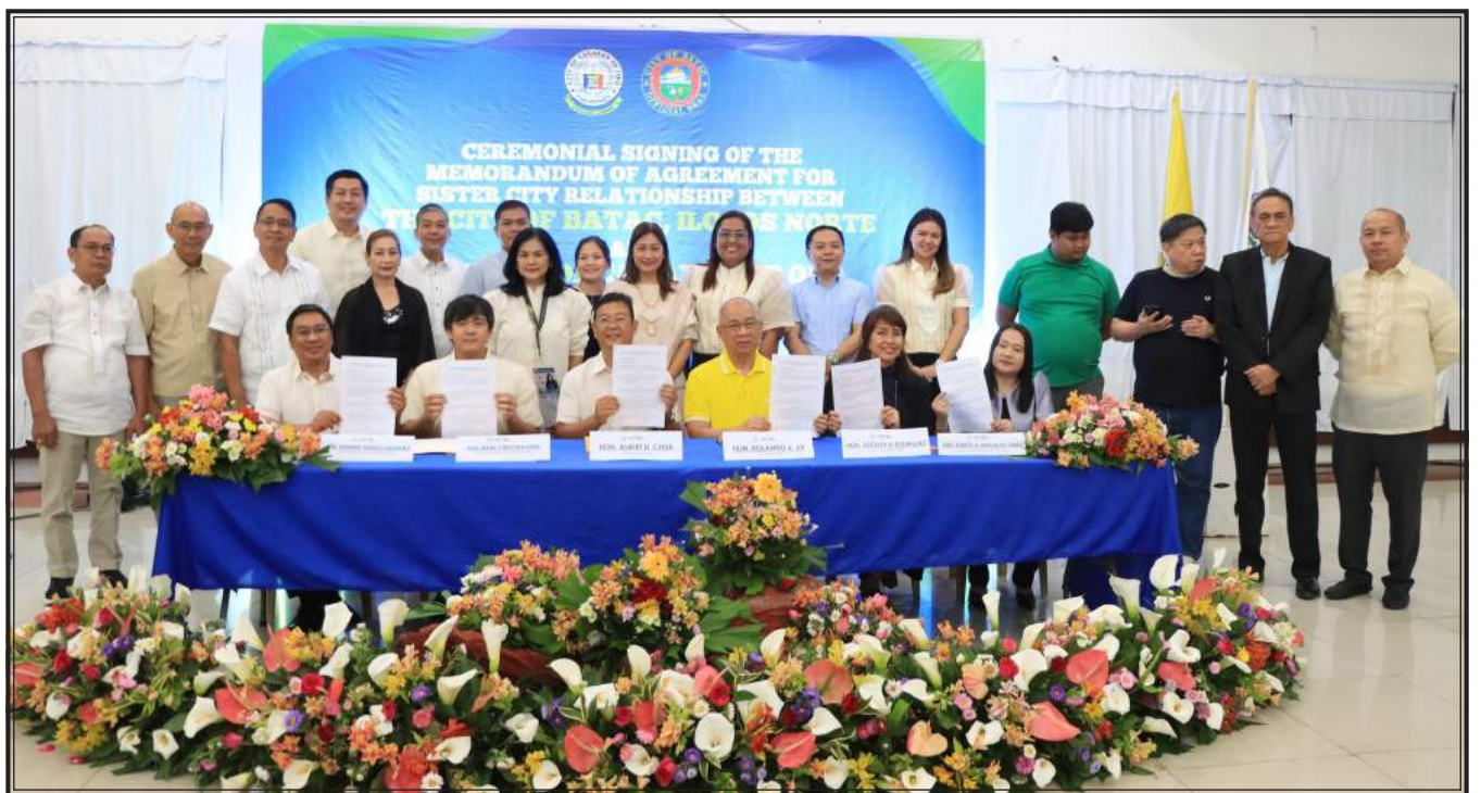
Mayor Albert D. Chua of Batac City and Mayor Rolando "Klarex" Uy of Cagayan De Oro City led the ceremonial signing of Sister City Agreement between the cities of Ilocos and Mindanao held at the Cagayan de Oro City Hall on November 6, 2023.

Other parties shall be invited to submit their bids (Pls. turn to page 11)