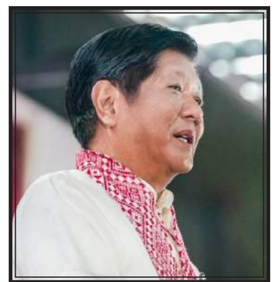
Pres. Marcos Jr.

administration, the PCO pointed out that the labor market saw significant progress, with unemployment dropping from 5.3 percent in August 2022 to 4.4 percent in August 2023 while underemployment improved