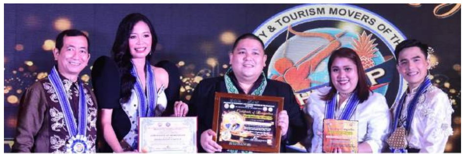
Your Ilocano Educator receiving the Phenomenal and Outstanding Educator Advocate and Radio Host of the Year Award on October 08, 2022, exactly one year ago.