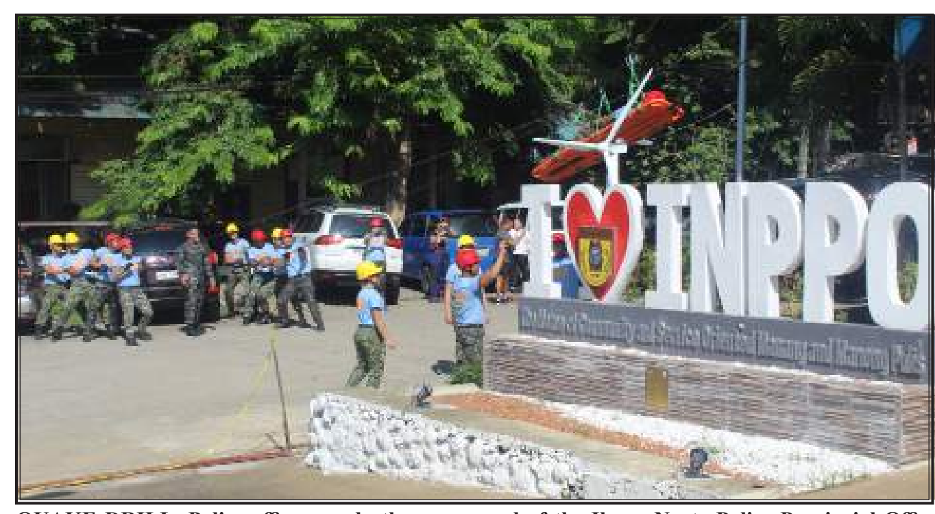
QUAKE DRILL. Police officers and other personnel of the Ilocos Norte Police Provincial Office show their rescue capability skills during the National Simultaneous Earthquake Drill for the second quarter on June 8, 2023. The said drill aims to raise awareness and increase readiness among personnel of the INPPO in case an earthquake hits the province.