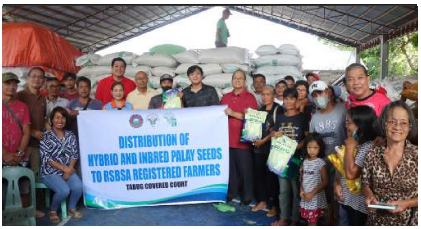
The Batac City government headed by Mayor Albert D. Chua distributed free palay seeds to Batacqueño farmers on June 6, 2023, with the presence of Vice Mayor Windell D. Chua and SP members. Over 2,000 farmers benefited from the free seeds program which aims to help boost the city's agricultural productivity and the province's food security.