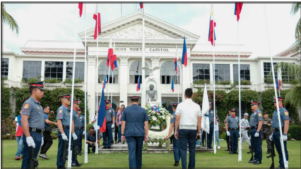
In commemoration of the 125th Philippine Independence Day, the Provincial Government of Ilocos Norte, led by Governor Matthew Marcos Manotoc, held solemn flag-raising and wreath-laying ceremonies at the Provincial Capitol ground in Laoag City on June 12, 2023.

“Napakaimportante po sa amin ang inyong naging participation because it displayed your commitment and initiative towards making your hospitals energy-efficient and climate change resilient kasama na dito ang pag-pursue at pag-raise ng standards to ensure that your facilities are aligned with the (Pls. turn to page 5)