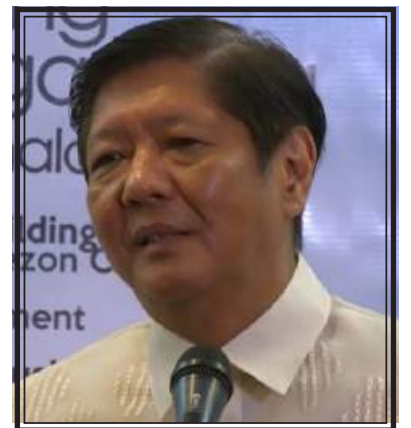
Pres. Marcos Jr.

resident Ferdinand R. Marcos Jr. wants a “more cohesive” manner in addressing the problem of hunger and the indigency in the country, Health Secretary Ted Herbosa Jr. said on Tuesday.