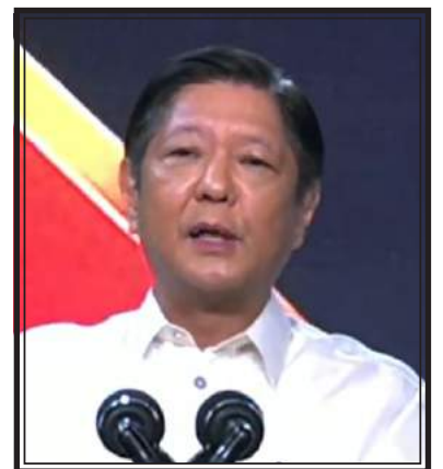
Pres. Marcos Jr.

about the healthcare manpower. Our nurses are the best, buong mundo na ang kalaban natin dito (referring to nurses migrating to other countries where pay is higher)," the President said during a meeting with the Private Sector Advisory Council (PSAC) Healthcare Sector group in Malacanang Palace Wednesday.