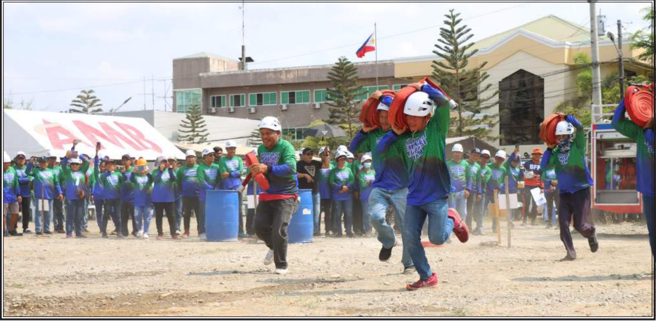
To boost the skills of Barangay Emergency Response Teams (BERT) as first responders in fire-related emergency cases, the City Government of Batac conducted a Firescuelympics on March 30-31, 2023. The competition served as the city’s culminating activity of Fire Prevention Month. It was facilitated by the City Disaster Risk Reduction and Management Office (CDRRMO) in partnership with the Bureau of Fire Protection-Batac.