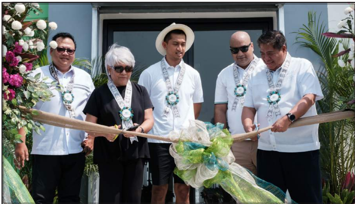
Governor Matthew Marcos Manotoc attended the inauguration rites for the 2nd phase Solar Power Project of Nuevo Solar Energy Corporation located in Currimao, Ilocos Norte on March 30, 2023. In a brief speech, Governor Manotoc commended the project's investors assuring them of full support by the provincial government. In the photo, Vice Gov. Cecilia Araneta-Marcos co-leads the ribbon-cutting ceremony.