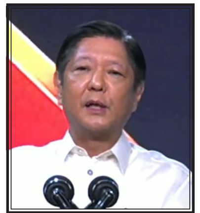
Pres. Marcos Jr.

Speaking during the awarding ceremony for the 2023 Outstanding Women in Law Enforcement and National Security at Malacañang Palace, President Marcos acknowledged the remaining challenges that block the progress of women despite the country’s great strides in promoting gender equality.