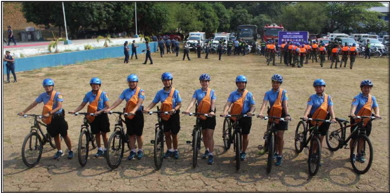
The Ilocos Norte Police Provincial Office (INPPO) under Police Director P/Col. Julius C. Suriben has formed an all-women police group for tourists as it expects a large number of visiting local and foreign tourists to this northern province during the summer season.

PRO1 officials said they will continue the implementation of IMPLAN “Ligtas SUMVAC” until May 31, 2023 to ensure the peaceful celebration of other upcoming public holidays, notably Labor Day, and Flores de Mayo festival. (PRO1-PIO)