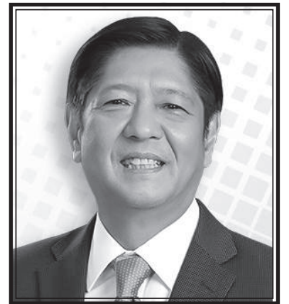
Pres. Marcos Jr.

message, President Marcos enjoined the faithful to take the day "to pause and give thanks for the opportunity for renewal and recovery as we push through our quest for genuine unity and progress for all."