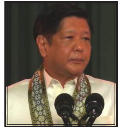
Pres. Marcos Jr.

President Ferdinand R. Marcos Jr. has directed different government agencies to make the necessary preparations and come up with a whole-of-government strategy to address the looming dry spell or El Niño