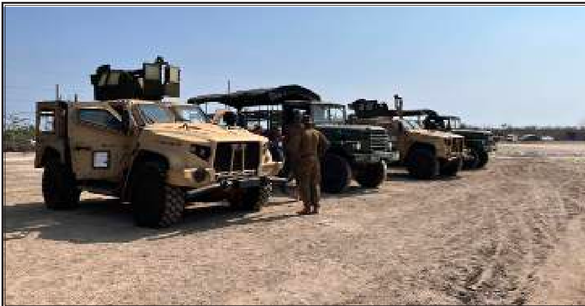
The Philippine Marines and United States Marines conducted a joint static display of capabilities and demonstration near Cape Bojeador in Burgos, Ilocos Norte. It is part of the ongoing Philippine-US Balikatan Exercise 2023.