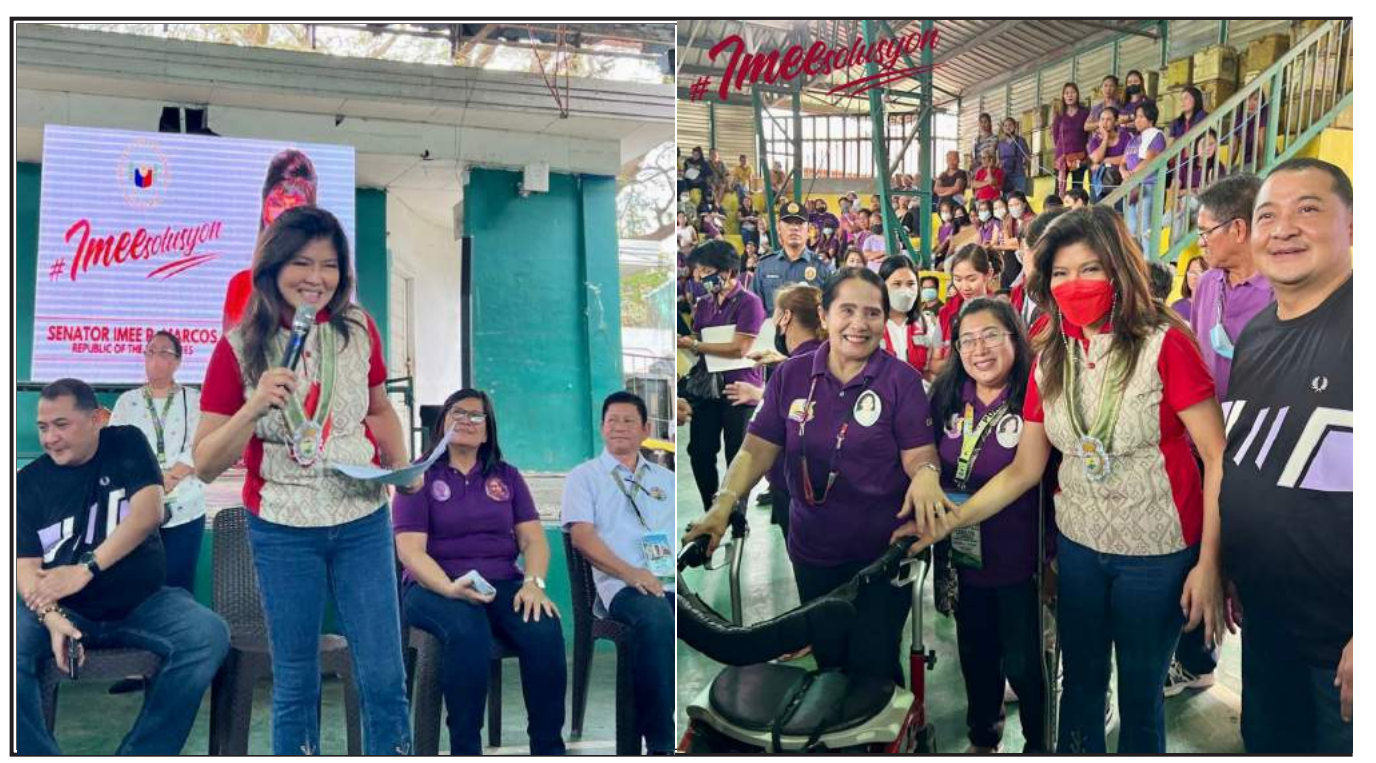
Photos show Senator Imee Marcos visiting Guimba, Nueva Ecija where she distributed P3,000 cash assistance to women folks as part of the Women's Month celebration. Earlier, she also visited the nearby Cuyapo town for the same activities.