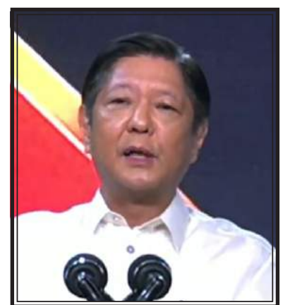
Pres. Marcos Jr.

conference very quickly earlier, I see that the actions here, the violent instances of encounters et cetera, have slowly come down and looking at that, all I can say is that once again, I have always been a – I have always said that of all the sectors of society, it is only the military that has never let the Filipino down,” the President said during his Talk to Troops in the AFP’s 9th Infantry Division based at Camp Elias Angeles, San Jose in Pili, Camarines Sur.