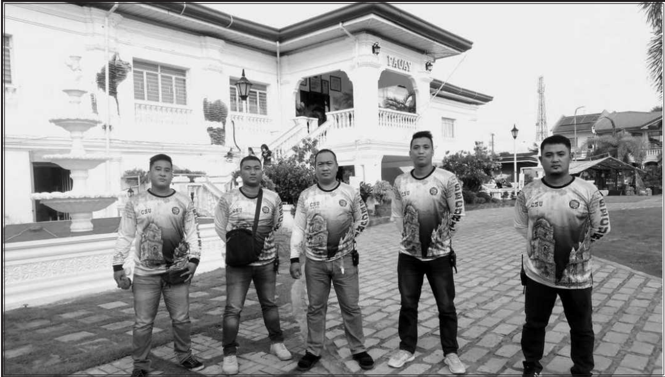
Paoay (Ilocos Norte) Mayor Shiella Galano expressed full support to the LGU-Paoay s new Civil Security Unit (CSU) operatives (shown in the above photo). The CSUs are mainly tasked to secure and maintain peace and order within the Paoay municipal hall and its vicinity as well as other LGU-Paoay installations/facilities under their AOR in coordination with the local PNP. (Text by Sentinel)

Republic of the Philippines Local Civil Registry Office Province of Ilocos Norte Municipality of San Nicolas