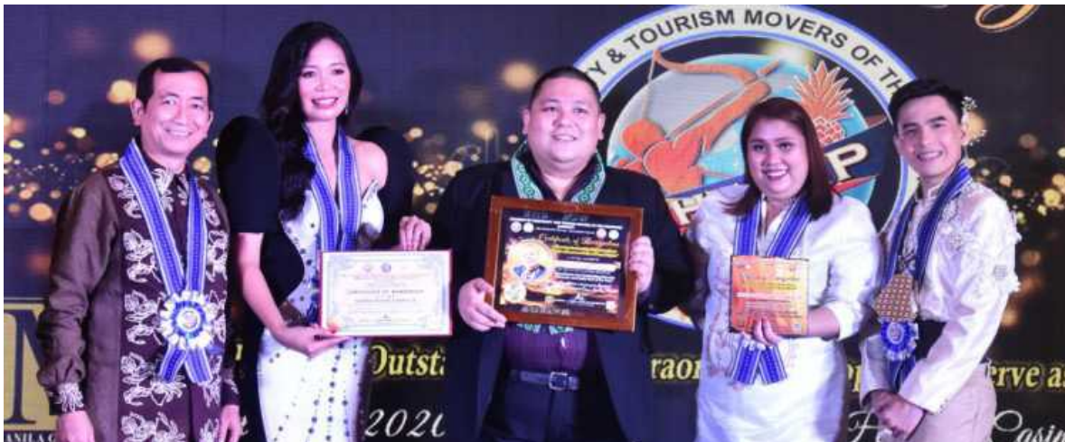
The author (middle) receiving his award from the Alliance of Hospitality and Tourism Movers of the Philippines (AHToMP) for his education reform advocacy through media. One of his advocacies is the crusade against communism and leftism in schools, apart from his constantly valiant fight against teacher and student exploitation.