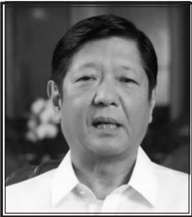
Pres. Marcos Jr.

President Ferdinand R. Marcos Jr. on Saturday said the Philippines will be in a better position to resolve pressing challenges amid tense regional geopolitical situation if it forges strong partnerships with like-