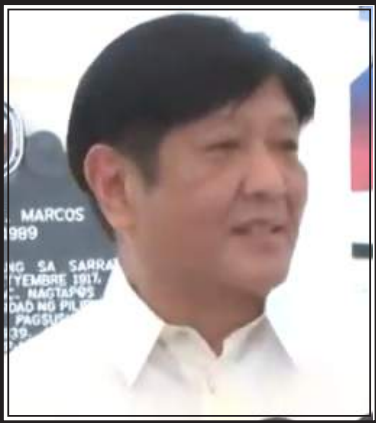
Pres. Marcos Jr.

In a speech in Batac City, Ilocos Norte, Marcos said this year’s celebration of the late