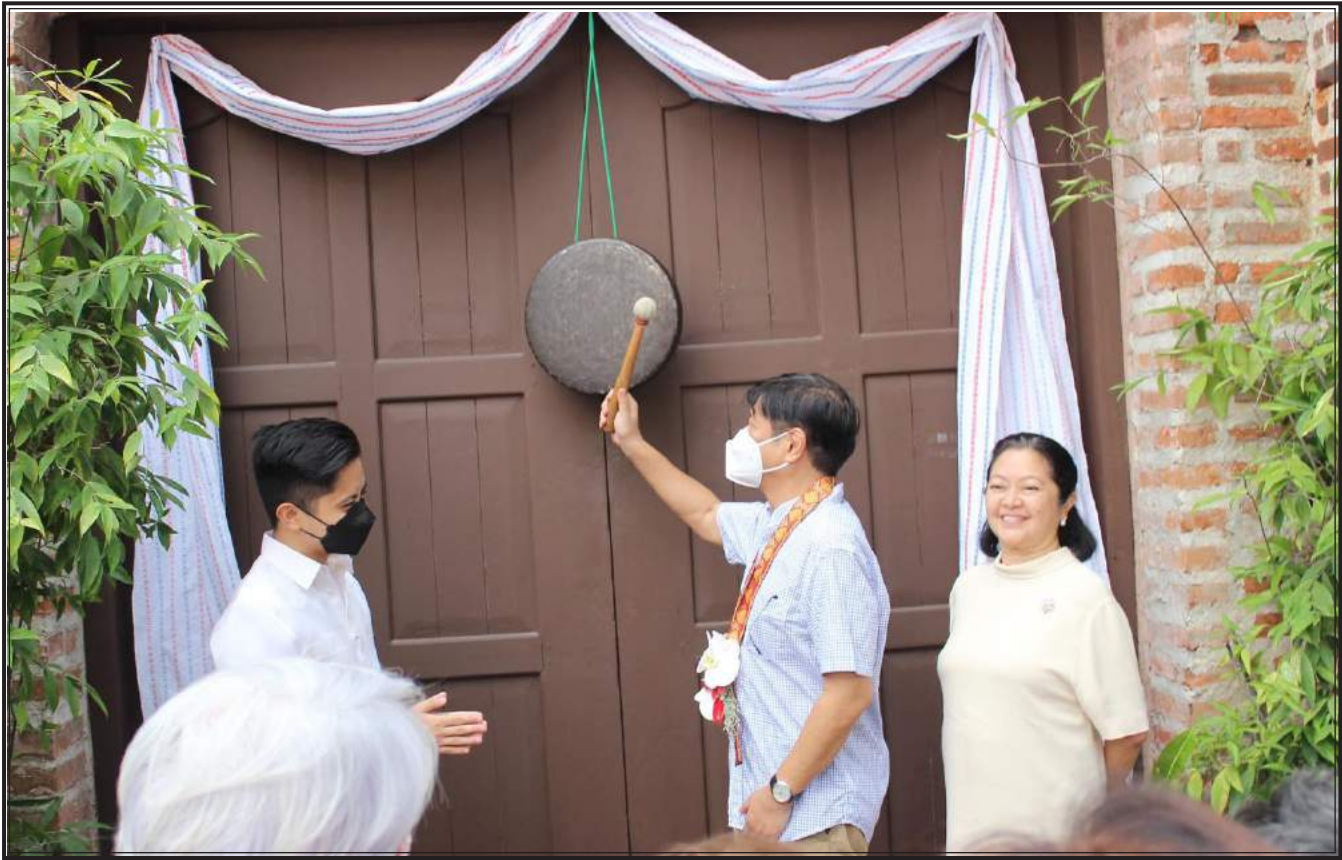
President Ferdinand “Bongbong” Marcos Jr. (center), together with First Lady Liza Araneta-Marcos and 1st district Rep. Sandro Marcos, formally opens to the public the remodeled provincial museum called Museo Ilocos Norte on September 11 as a part of the 105th birth anniversary celebration for the late President Ferdinand E. Marcos.

amounting to P989,460.50 which forms part the provision of bio-pesticides, plastic drums, net mesh, plastic mulch, pump and engine, soil auger, molasses and seedling trays.