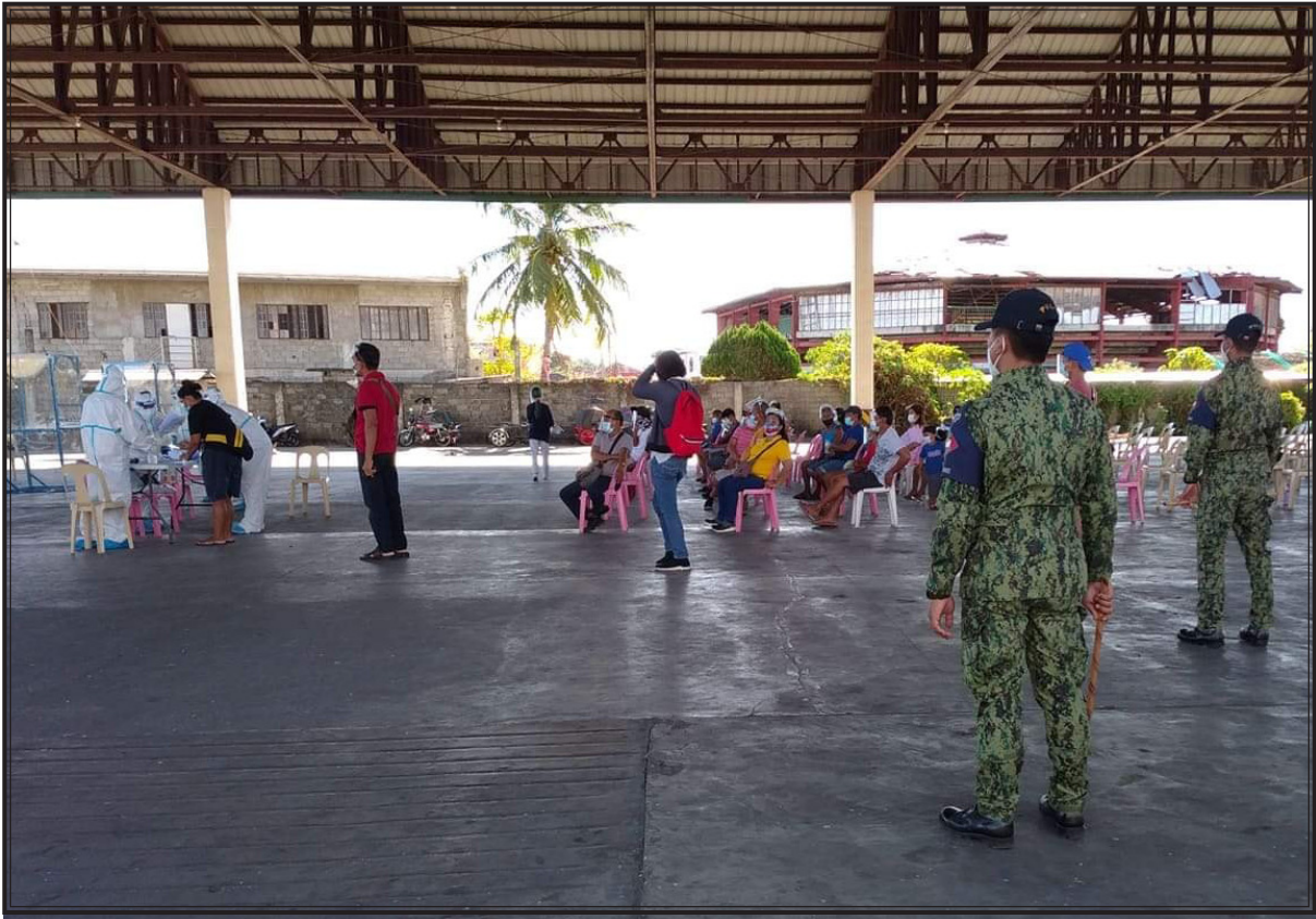
MASS SWAB TESTING. In line with contract tracing guidelines, local health authorities conducted mass swab testing (shown in the above photo) at Central Terminal located in Brgy 1, Laoag City after several residents were infected with the COVID-19.

BADOC, Ilocos Norte, Jan. 8, 2021--Lawmen arrested three more travelers for using alleged fake antigen test results, an offense repeatedly committed here since the COVID-19 pandemic.